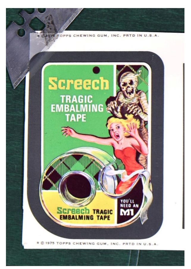
"Wacky Packages" 13th Series clear acetate white back sticker stock Image 03b

So, were these "Wacky Packages" 13<sup>th</sup> Series clear acetate stickers ever tested? I have to assume they were indeed tested. Since both these stickers and the "Comic Book Heroes Stickers" clear acetate stickers originated from the Topps' Duryea plant, one can argue they were sent to the "Card Processing" department to be cut, collated and packaged for testing, otherwise, one would assume they would have gone to the Brooklyn office if they were just printed for proofing and review. We have no definite evidence of this for either issue however. I can envision Topps not die-cutting the stickers since the background was clear, but they did die-cut the "Comic Book Heroes Stickers" so it could go either way.