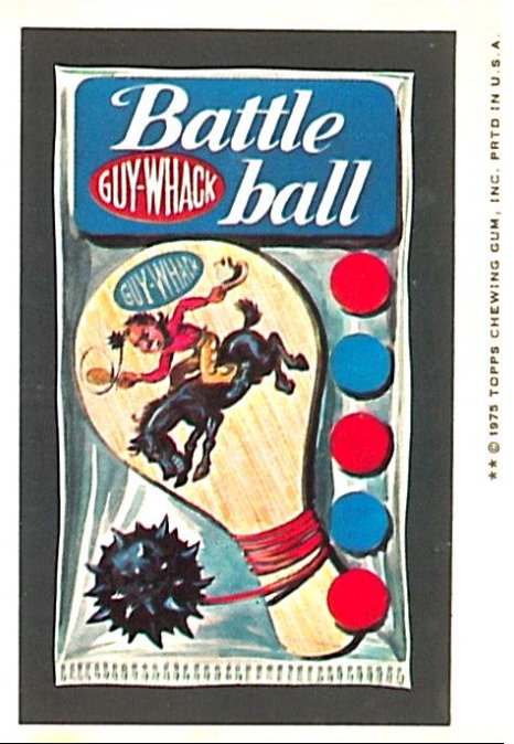
"Wacky Packages" 13th Series acetate sticker Image 02a