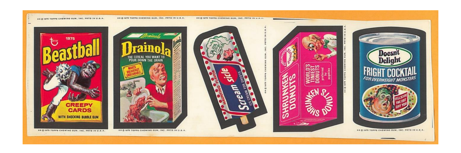
"Wacky Packages" 13th Series clear acetate stickers strip Image 03

The 13<sup>th</sup> series of "Wacky Packages" were released around February/March of 1975 according to the wackypackages.org website, run by collector Greg Grant. Topps most likely printed these 13<sup>th</sup> series acetate stickers from the same print sheet layout as the regular stickers, and probably around the same time or very soon after, if the same procedures took place as with the "Comic Book Heroes Stickers" acetates. Considering both these "Wacky Packages" and the "Comic Book Heroes Stickers", it is obvious Topps was experimenting with the clear acetate sticker stock, so it would be no surprise at all if other clear acetate issues (especially sports) eventually turn up. From my research, I've found Topps was tenacious when it came to experimenting and testing new ideas like cloth stickers, clear acetate stickers, size and format of cards and non-traditional novelty releases. They would try to use the new stock, size, format or novelty across both sports and non-sports releases in the hopes an issue would excel and be successful enough to fully release at retail.